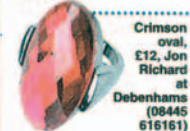
Crimson oval, £12, Jon Richard at Debenhams (08445 616161)