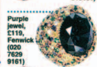
Purple jewel, £119, Fenwick (020 7629 9161)