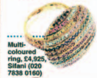
Multi-coloured ring, £4,925, Sifani (020 7838 0160)