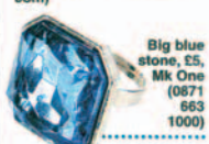
Big blue stone, £5, Mk One (0671 663 1000)