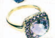
Lilac, £96, QVC (www.qvcuk.co.uk)