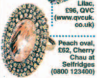
Peach oval, £62, Cherry Chau at Selfridges (0800 123400)