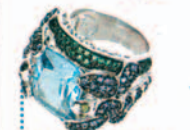
Blue with green detail, £98, Butler & Wilson (020 7409 2955)