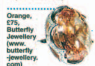
Orange, £75, Butterfly Jewellery (www.butterfly-jewellery.com)