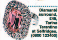
Diamanté surround, £49, Tarina Tarantino at Selfridges, (0800 123400)